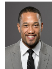
Marcus Freeman Co-Defensive Coordinator